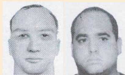
FACES composite and arrest photo of South Florida rapist

For product information visit us at http://resourcemanagement.net/faces.htm or call Charles directly 704-756-5446.